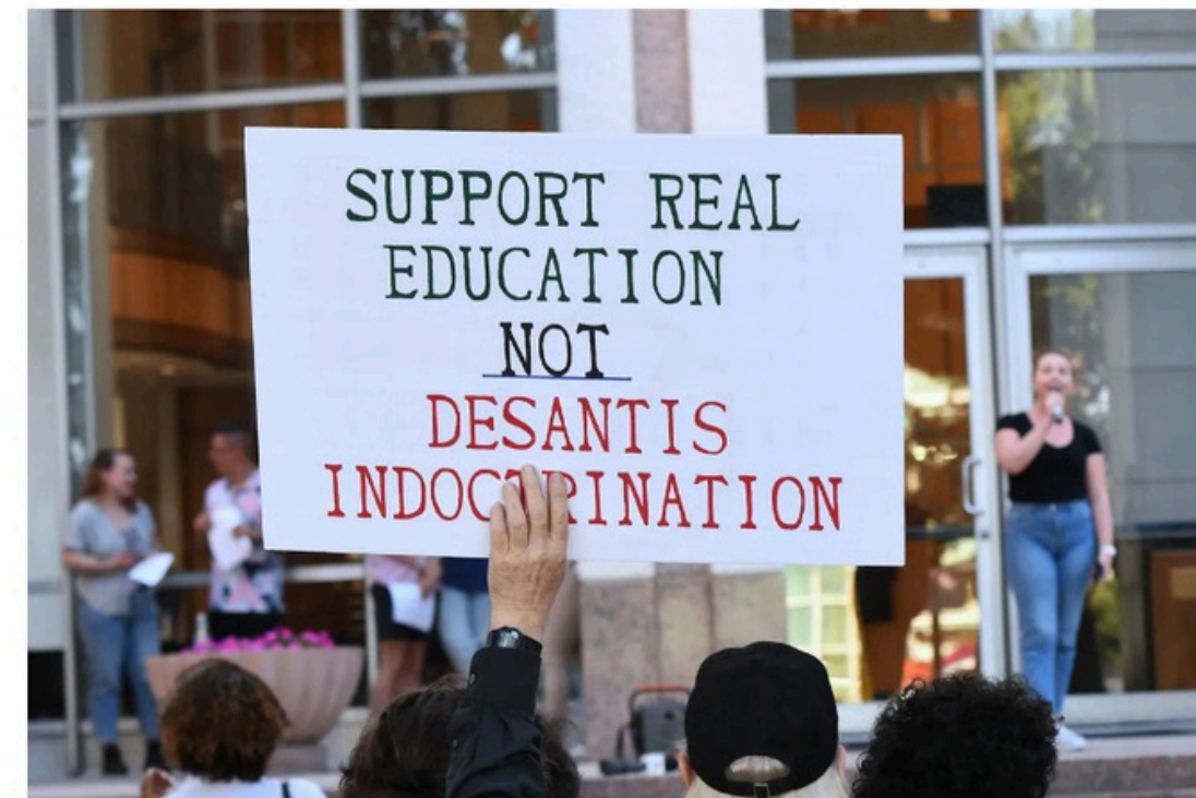
Students and others attend a rally to protest Florida education policies outside Orlando City Hall on April 21, 2023, in Orlando, Florida.